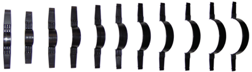
D2K HDPP INJECTION MOLDED STRAPS (RISE IN INCHES)