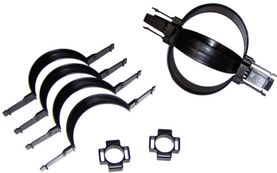
4-Strap Centralizer: 2 collars and 4 Straps per assembly

The 3-Strap and 4-Strap Collars require three and four straps, respectively. If your application permits, the 6-Strap and 8-Strap Collars allow for less straps per collar than possible. For instance, only three straps may be required utilizing a 6-Strap collar, and only four straps may be required utilizing the 8-Strap collar. Straps are often eliminated to allow for grout tube lines. Using fewer straps also reduces unit cost.